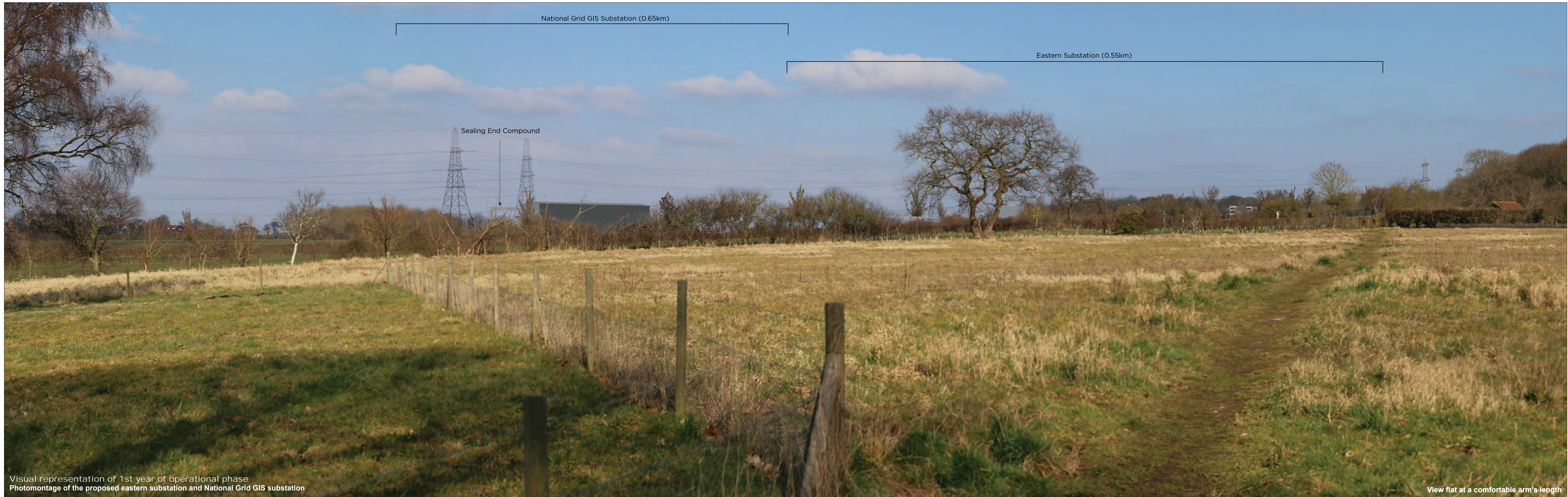
Visual representation of 1st year of operational phase Photomontage of the proposed eastern substation and National Grid GIS substation