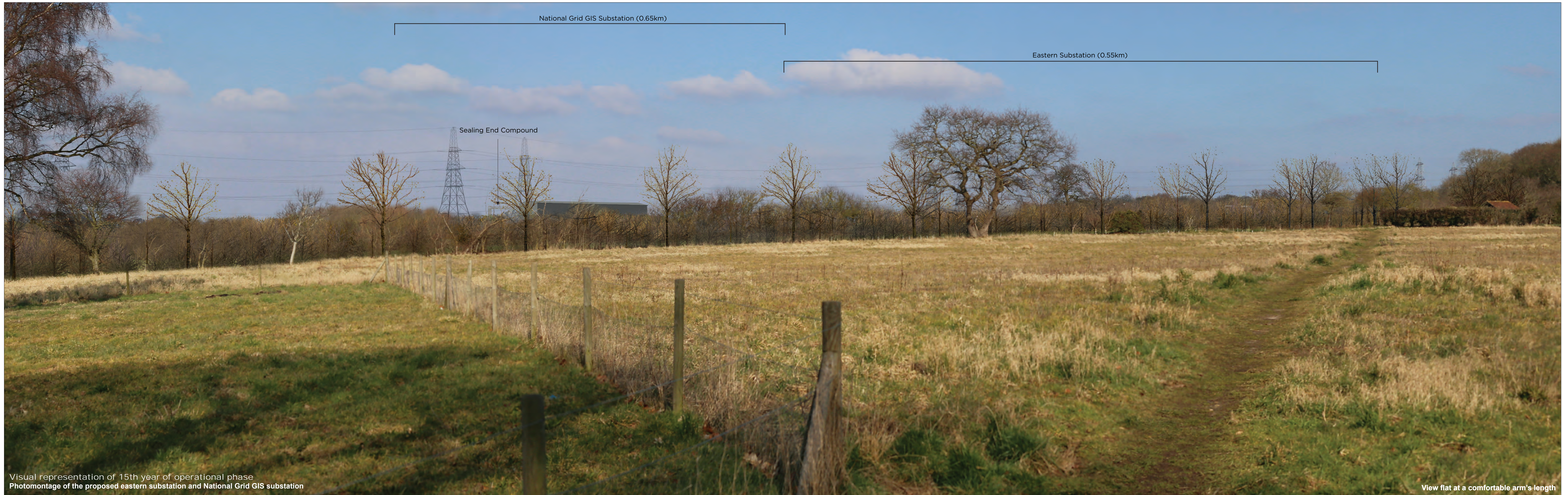
Visual representation of 15th year of operational phase Photomontage of the proposed eastern substation and National Grid GIS substation