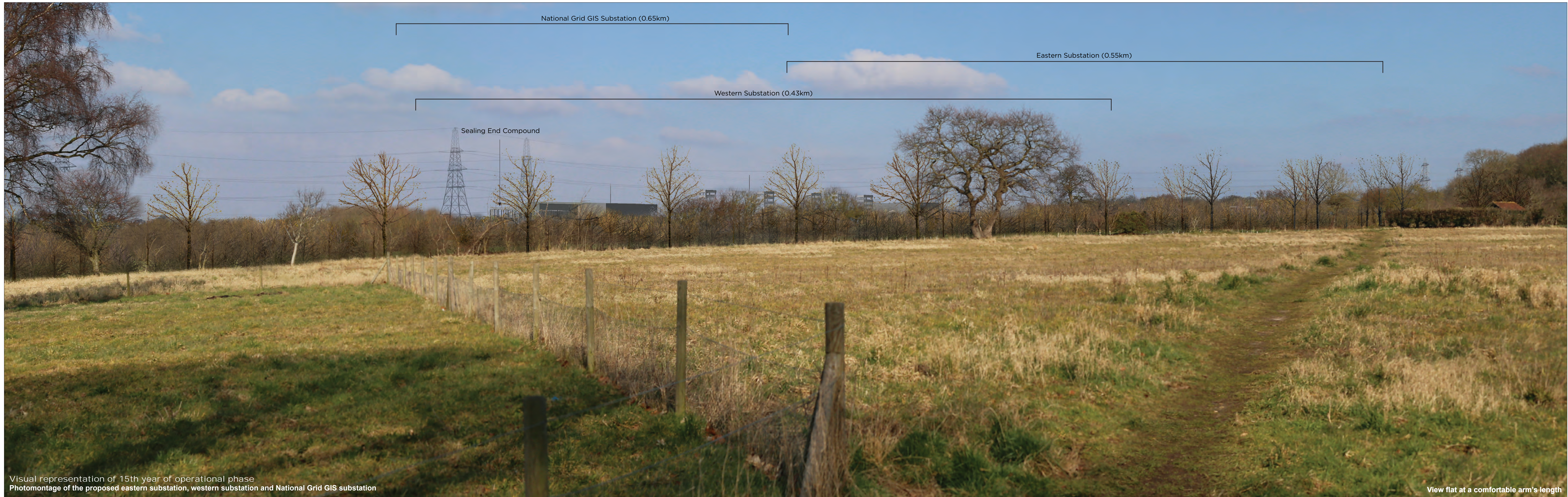
Visual representation of 15th year of operational phase Photomontage of the proposed eastern substation, western substation and National Grid GIS substation