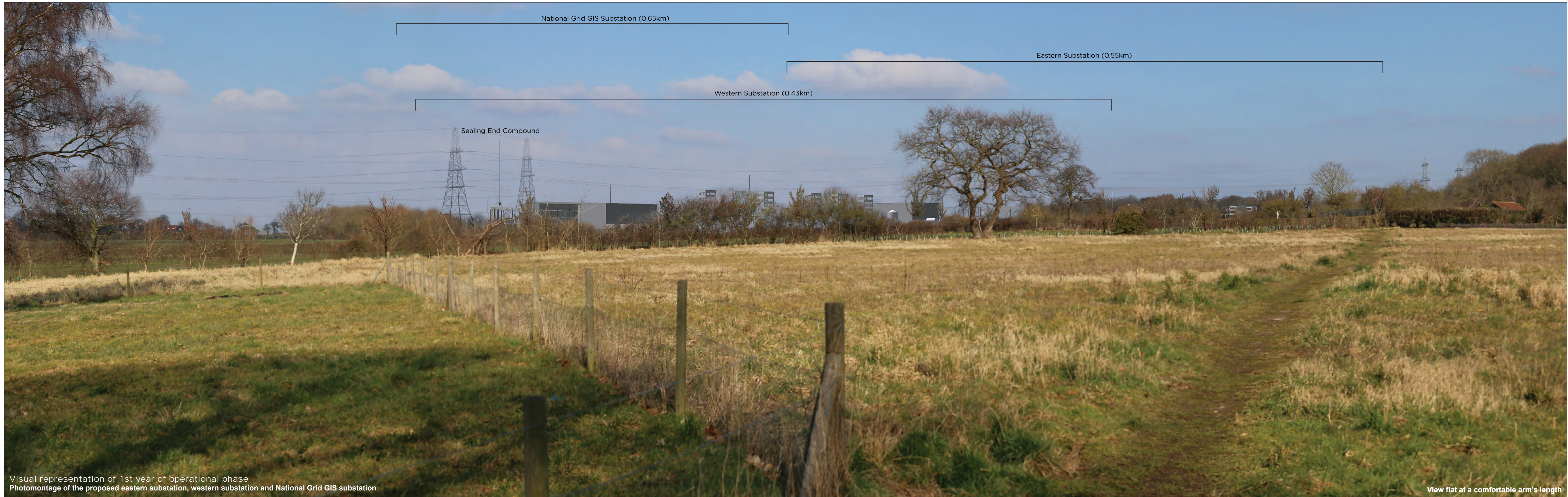
Visual representation of 1st year of operational phase Photomontage of the proposed eastern substation, western substation and National Grid GIS substation